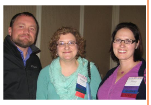
2013 KPA Annual Awards: The 2013 KPA Annual Awards luncheon was held on Friday, November 15th, during the KPA Convention. Congratulations to the award recipients!